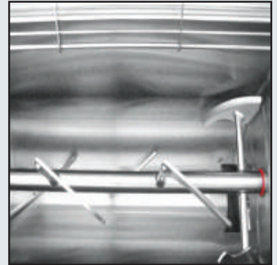
Large Radius Corner ends Removable Stainless Steel Paddle

The highly polished interior hopper and the efficient and removable Mixing Paddle of the Mincer Mixer stops mince sticking to the machine resulting in less wasted product, and easier, quicker clean and better hygiene. The bottom line is more profit to the operator from a higher yield, reduced time to clean and a visually appealing & longer shelf life mince. These features are sure to please every quality & efficiency conscious operator and most importantly their customers.