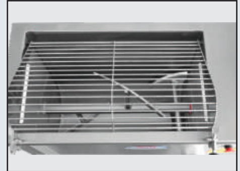
Stainless Steel Grill type Lid

Contact us for a list of un-biased Hall Equipment users in your region/state.