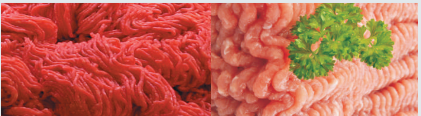
Visually appealing & Long Shelf Life Mince without preservatives