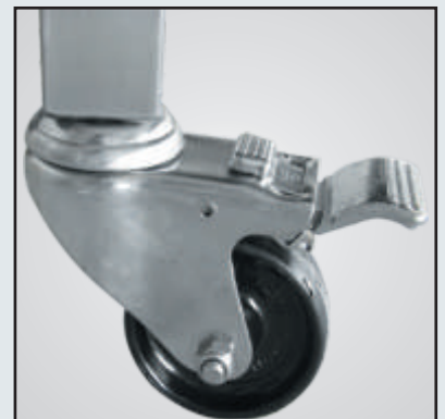
Stainless Steel Casters with Locks