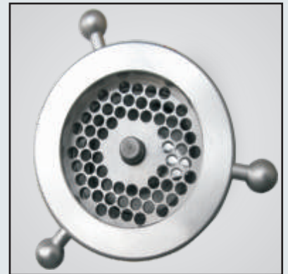
42 Size Cutting Head with 42 Size Worm