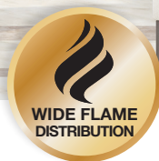
WIDE FLAME DISTRIBUTION