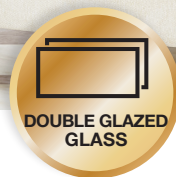
DOUBLE GLAZED GLASS