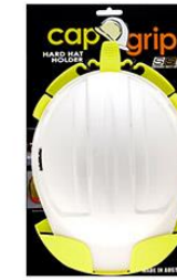
Yellow Holder (with Helmet)