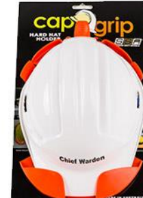
Chief Warden Kit