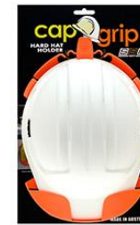
Orange Holder (with Helmet)