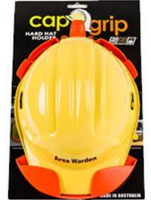
Area Warden Kit