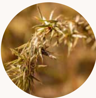
1. Native Silky Lemon Grass or Cympobogon ambiguus

Arrente Name: Aherre Aherre Pronounced - A harr a - A harr a