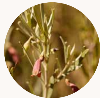
3. Emu Bush or Eremophila longifolia

Irlweke, also known as White Cypress Pine, has leaves and resin that are soaked in water to create an antiseptic body wash and anti-anxiety aromatic medicine. The tree can be found growing in rocky hill country, where it's protected from fire.